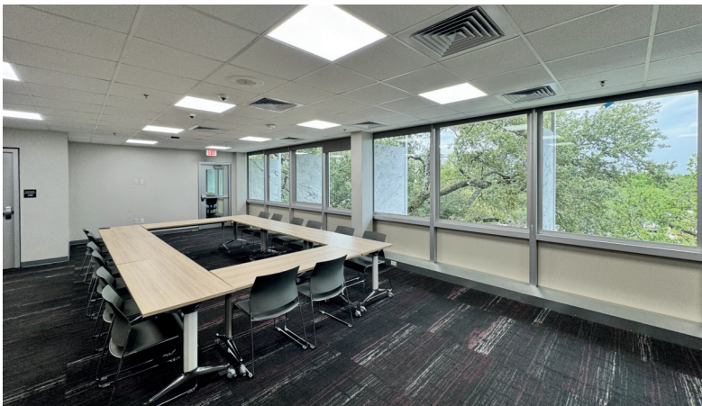
Community meeting space in new MidCity medical center at 2515 Canal Street